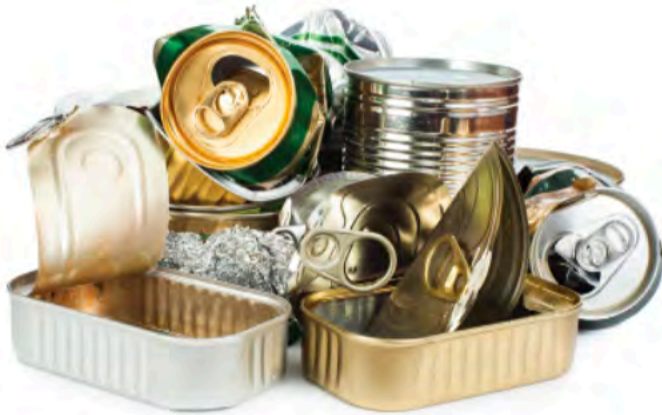
ALUMINUM & METAL CANS