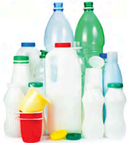
PLASTIC BOTTLES, JUGS, JARS & CONTAINERS