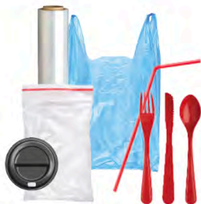
PLASTIC BAGS & FILM, CUP LIDS, UTENSILS & STRAWS