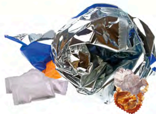
SNACK & CHIP BAGS, CONDIMENT PACKETS & CANDY WRAPERS