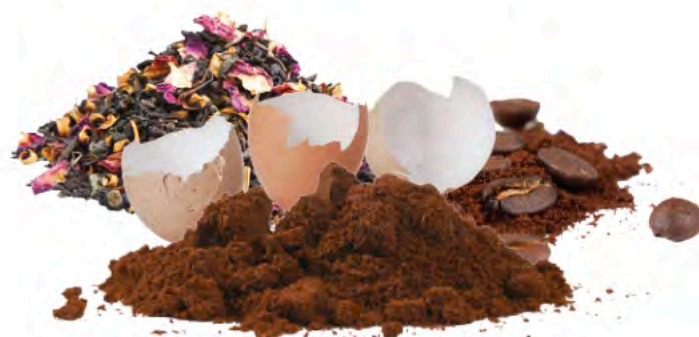
EGG SHELLS, NUTS, COFFEE GROUNDS, LOOSE TEA