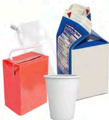
BEVERAGE POUCHES, MILK CARTONS, ASEPTIC CARTONS & TO-GO CUPS