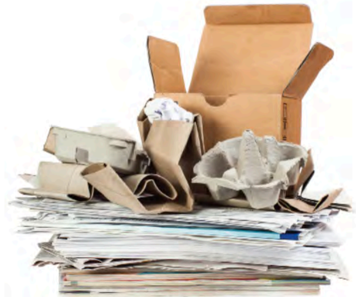
FLATTENED CARDBOARD, CLEAN & DRY PAPER