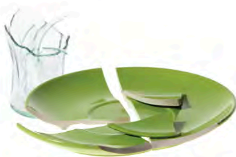
BROKEN GLASS & DISHES