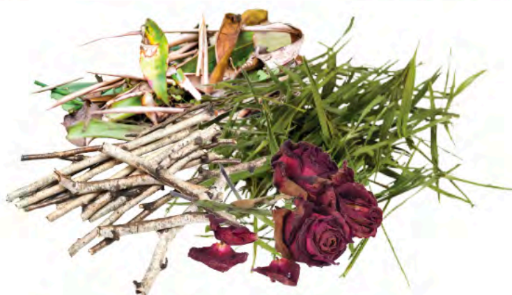
GRASS CLIPPINGS, LEAVES, CUT FLOWERS, SHRUB & TREE TRIMMINGS

Place organics loose in the cart, or use paper bags or compostable bags with ASTM D6400 rating only, no plastic bags