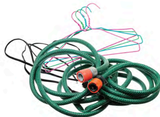
TANGLERS: HOSES, CLOTHES, WIRES & HANGERS