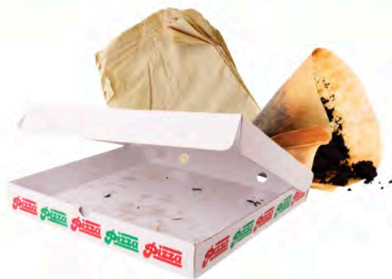
FOOD SOILED PIZZA BOXES, USED NAPKINS & PAPER TOWELS, USED COFFEE FILTERS & GROUNDS