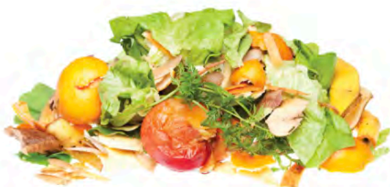
FRUIT & VEGETABLE TRIMMINGS & PEELS