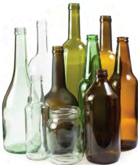
GLASS JARS & BOTTLES