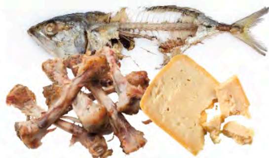
MEAT SCRAPS & BONES, FISH, CHEESE & BREAD