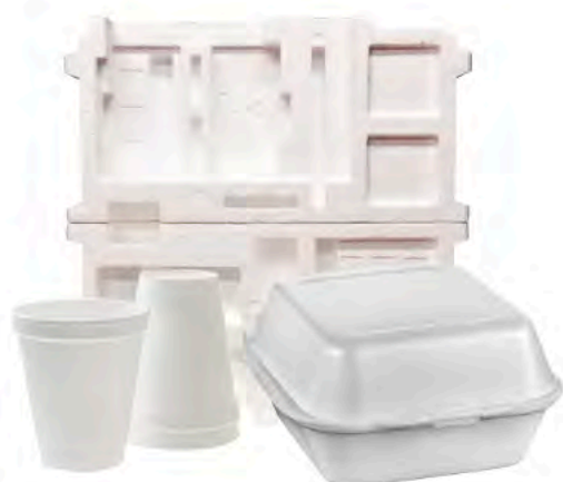
POLYSTYRENE FOAM CONTAINERS & PACKAGING